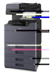
Kyocera TASKalfa 3554ci Multifunction Product

“The control software that we had verified in advance on ARC EV implemented in the Synopsys HAPS Prototyping System worked with almost no additional modification needed,” said Okada.