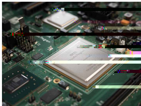
Figure 1: The Arm Morello SoC on TSMC 7FF process technology on the Morello prototype board

To help overcome these challenges Arm is leading a research program called Morello, which could radically change the way we design and program processors in the future, to enable better built-in security. This is funded by the UK government's Industrial Strategy Challenge Fund (ISCF) Digital Security by Design (DSbD) program. The main output of DSbD will be a technology platform prototype called the Morello evaluation board. (UKRI refer to this as The DSbD Technology Platform Prototype.)