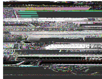
Lambertian Standard (Spectralon) from Labsphere