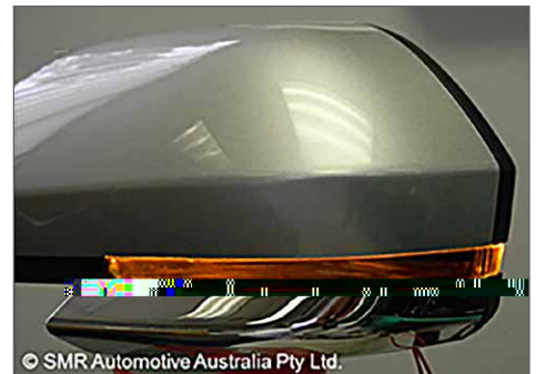
Figure 2: Photo of the manufactured side mirror.